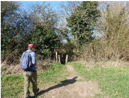
Through this gap in the hedge and follows in between paddocks and hedges is quite narrow and then opens out to exit onto to a quiet lane, Hall Lane.