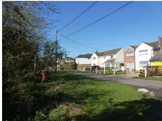
You can take a breather on the bench, head left down the lane (Hall Road), ignore the first fingerpost and Bridle way on the left. Go past the speed limit signs.