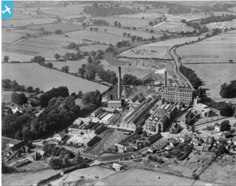
Church, Courtaulds Mill and the Pant Valley 1937

You have just walked through the area of the Old Courtaulds Bocking Mill which ceased production in 1980. Courtaulds' were famous for the manufacture of mourning crepe popularised by Queen Victoria. Bocking and Braintree have many buildings etc endowed by the Courtauld family. St Mary's benefited both from the Church Hall which was the workers Canteen building, and from endowment of the East Window, Rood screen, Reredos and panelling.