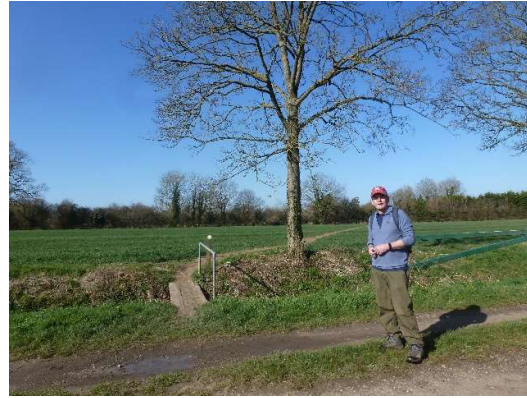
The path crosses the farm track and heads diagonally across the field through the crop.