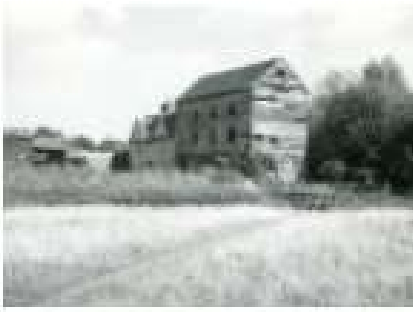
Straits Mill in the 1960's.

Our walk continues on the track the other side, turn right and go towards the water treatment plant, there are occasionally vehicles on this track. At the entrance to the plant take the path on the right which leads to the river and follow the riverside walk down stream.