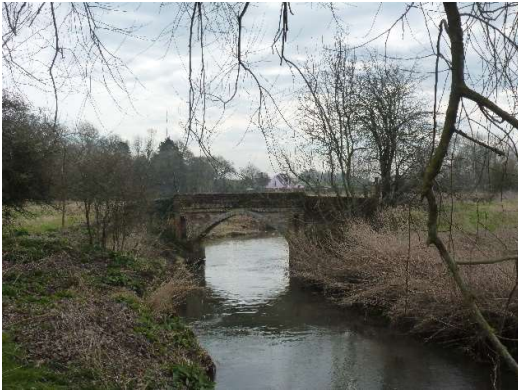
There is a set of way markers after the bridge just before our path turns to the left.