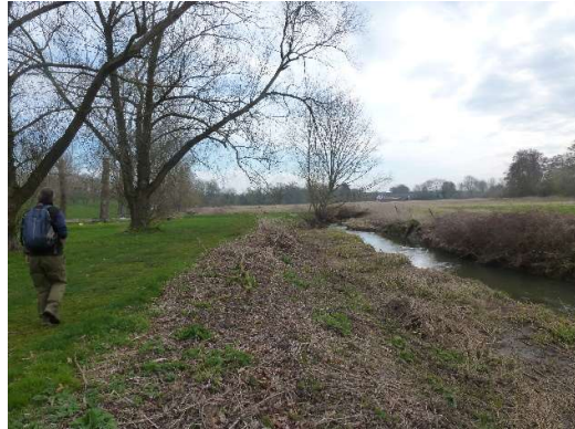
and close to the end of this riverside walk, a very nice little bridge, which you can admire.