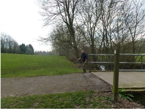
The path passes by the gauging station on the river