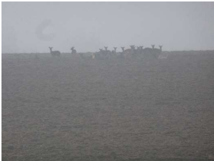
Deer in the field towards Iron Bridge Farm.

, around the buildings to across a field to where the path meets Iron Bridge Lane.