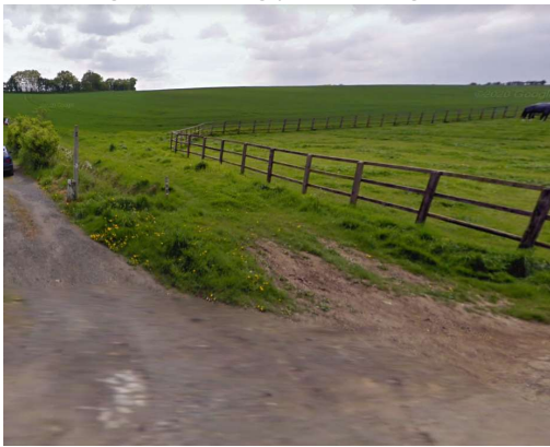
Looking back along path from Water Lane.

Immediately after leaving the farm buildings there is a path on the right, take this path, which after some distance turns 90 degrees right. After a short distance take the turn to the path on left. Following this curving path through the fields. The path straightens as it nears Water Lane.