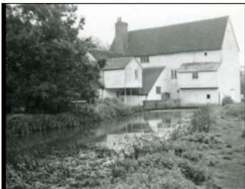
Codham Mill in 1951

Cross the bridge over the river to follow the mill run to Codham Mill.