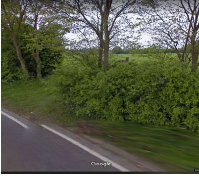
Gap in the Hedge where path meets road.

Cross the road, to walk a short distance towards Shalford.